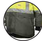
Longer tail flap with reflective tape