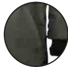
7 handy pockets, incl. 2 hand warmers