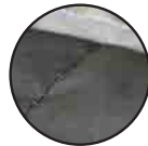
Heavy duty lining for added warmth