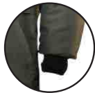
Sleeve gloves for added warmth